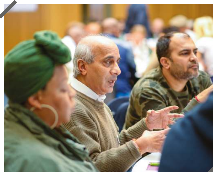
Brent Climate Assembly Image © Traverse

This is important in the context of addressing the climate emergency. Some policies will require changes to lifestyles that will not always be popular. Policies don't just need high levels of support but must also be perceived to be fair. Public deliberation tools are a very effective way to create this public support and perception of fairness.