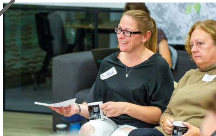
Leeds Climate Change Citizens' Jury