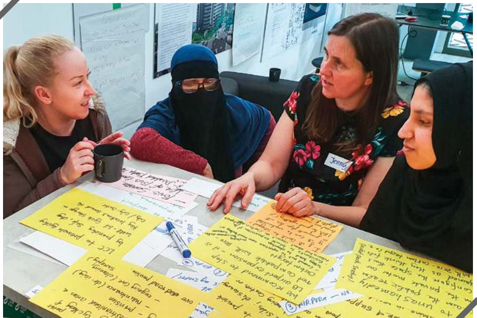
Leeds Climate Change Citizens' Jury

Well facilitated deliberation creates a greater perception of common ownership over a problem. This changes the dynamic away from citizens expecting an authority to 'fix' the problem on their behalf, or at the other end of the spectrum, of public authorities expecting citizens to bear all the responsibility to change. For example in Camden, participants of the citizens' assembly described how it changed their perception of the local authority – feeling 'proud of their council' for opening up their decision making process to residents.