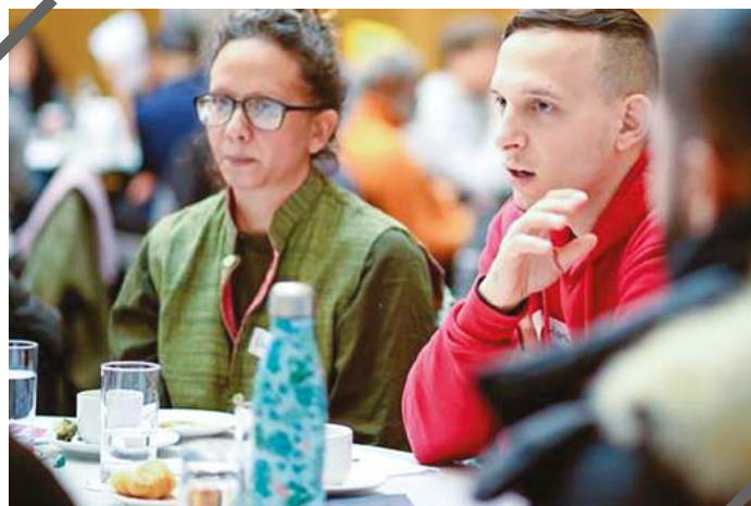
Brent Climate Assembly

was commissioned by Oxford City Council and focused on five themes which the council felt it had some control and influence over. 42 randomly selected residents of the city of Oxford took part in two weekends of structured deliberation. Assembly members were presented with three visions of possible futures for Oxford developed by the City Council as well as voting on a series of specific pre prepared questions. The process, which was organised by Ipsos Mori, 27 considered the overarching question “The UK has legislation to reach ‘net zero’ by 2050. Should Oxford be more proactive and seek to achieve ‘net zero’ sooner than 2050?”. 28