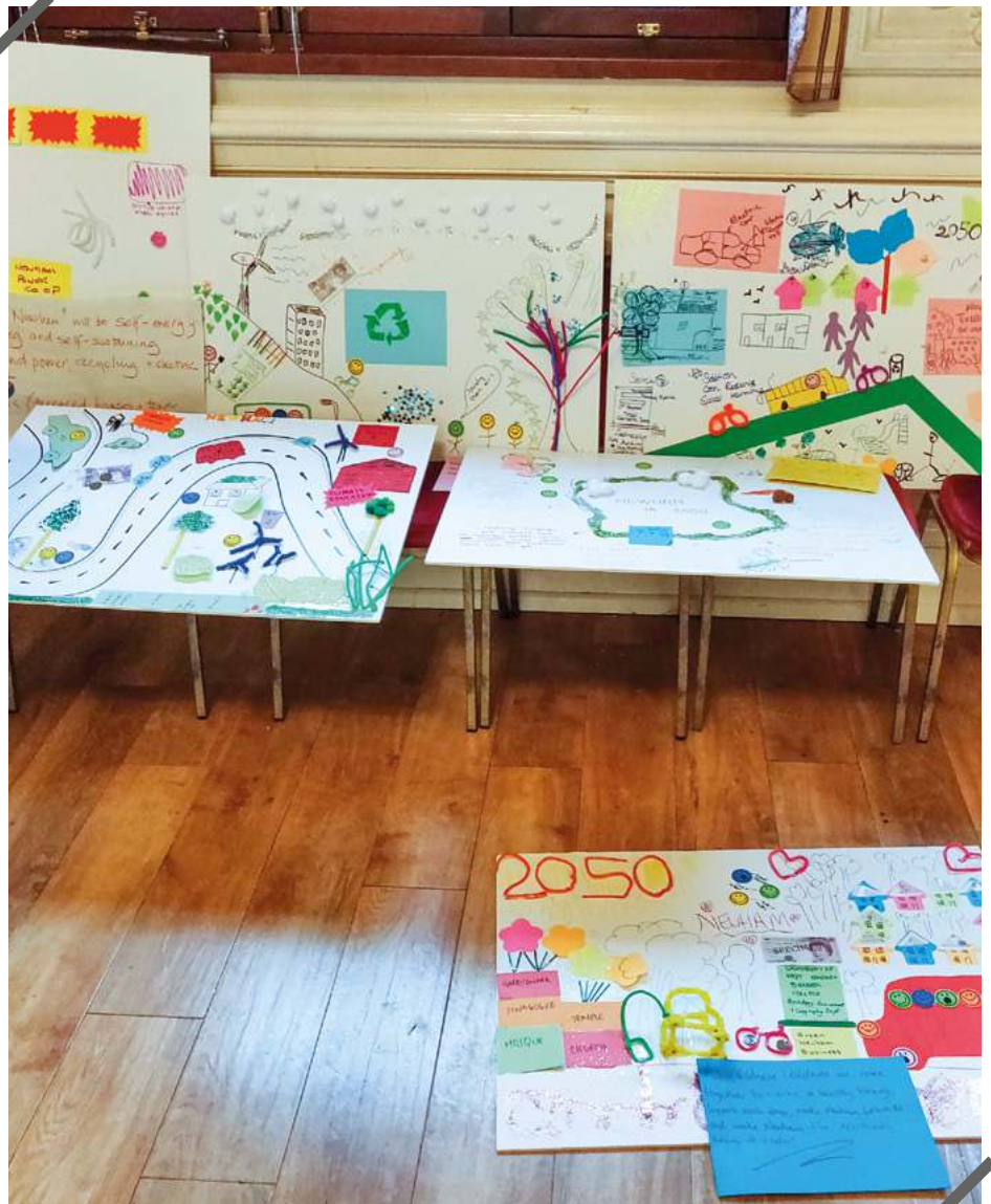
2050 visions by members of the Newham Citizens' Assembly on Climate Change.

‘Exchanging narratives about personally significant life episodes, sharing meals together and participating in activities designed to create a sense of group identity may be necessary to creating the emotional connection needed to motivate the kind of argument desired. (Rosenberg 2007). 67