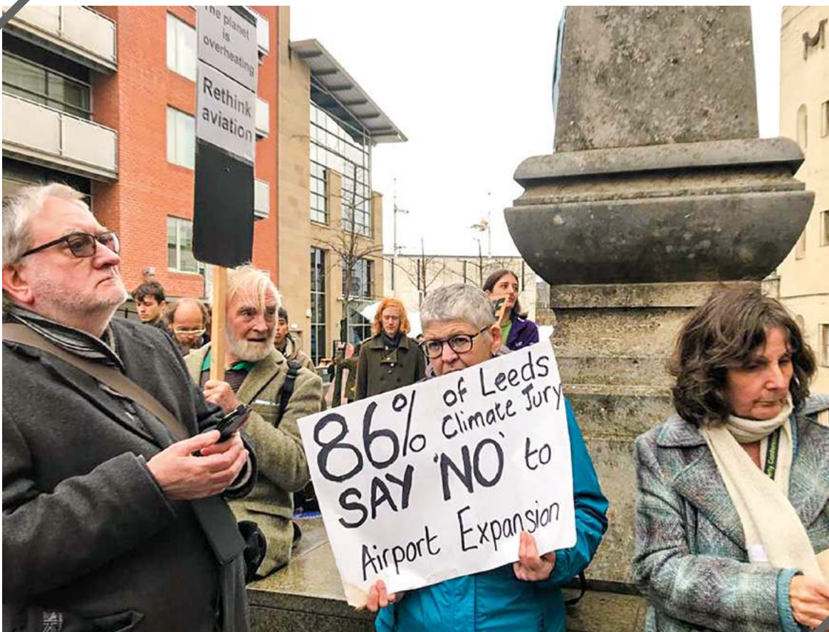
Leeds anti-airport expansion demonstration.

There is some anecdotal evidence from Camden, Leeds and Brent, that participants who went through the citizen assemblies then went on to undertake individual or collective action. Planning ahead on how to support and harness this as part of a local authority's wider public engagement on climate would be beneficial. For example, Camden followed their citizens' assembly with a 'think and do' pop-up space to support further local climate action.