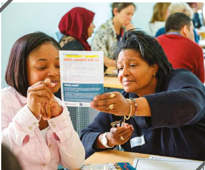
Camden Climate Assembly Image © London Borough of Camden Climate Assembly

declared a climate emergency it issued an open invitation 6 to youth clubs and schools to attend a Youth Climate Assembly. 7 Over 100 young people aged between 11 and 18, worked on small tables to firstly discuss and answer three questions and secondly to write their demands. These were then taken to the council's cabinet meeting which took place immediately after the 90 minute event. The information was well received by politicians and officers. However it is unclear what impact it has had on policy making. 8