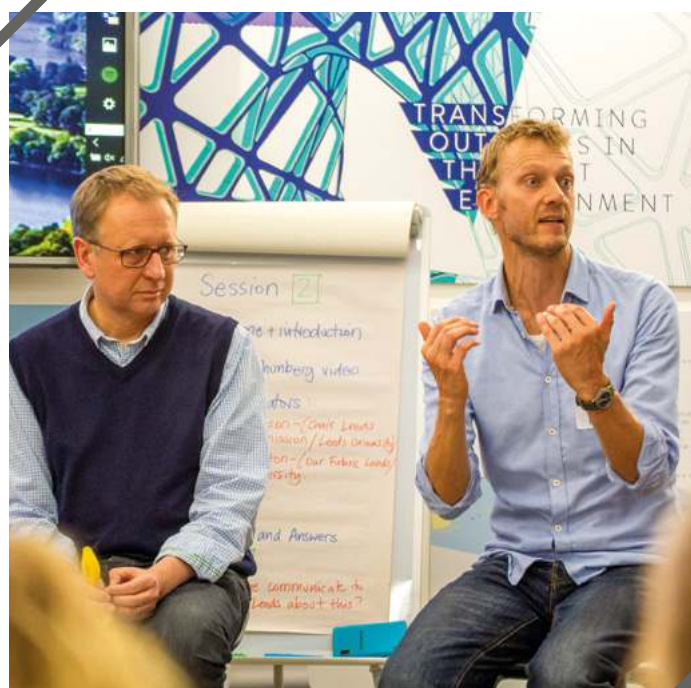
Leeds Climate Change Citizens' Jury

The role of the facilitation team in a deliberative process is central to its success. This role is fundamentally different to that of a chairperson within a traditional open meeting and requires a unique set of skills that draws upon a long history of participatory practice. The reputation of a jury or assembly held amongst its participants and also by those 'outside the room and looking in', whether policy makers or indeed the wider public, will largely be shaped by the actions of the team of facilitators. Generally local authorities have commissioned independent facilitators. If local authorities are considering using their own staff to facilitate mini-publics, they will need to think carefully about how to ensure the process is perceived as independent and that staff have the requisite skills and experience.