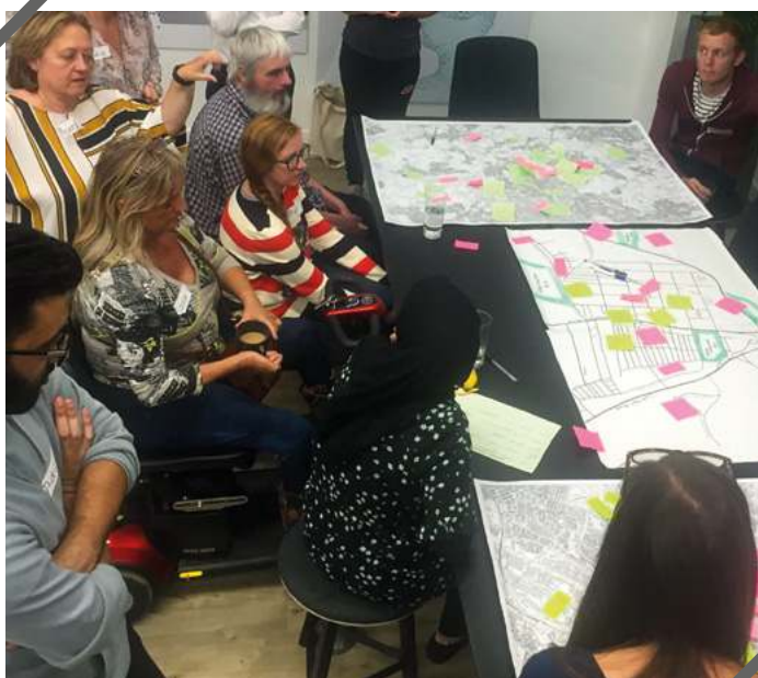
Mapping activities Leeds Climate Change Citizens' Jury

Problem trees (e.g. in Lancaster participants used a large drawing of a tree to start to unpack the root causes of the problem 'climate change has become an emergency').