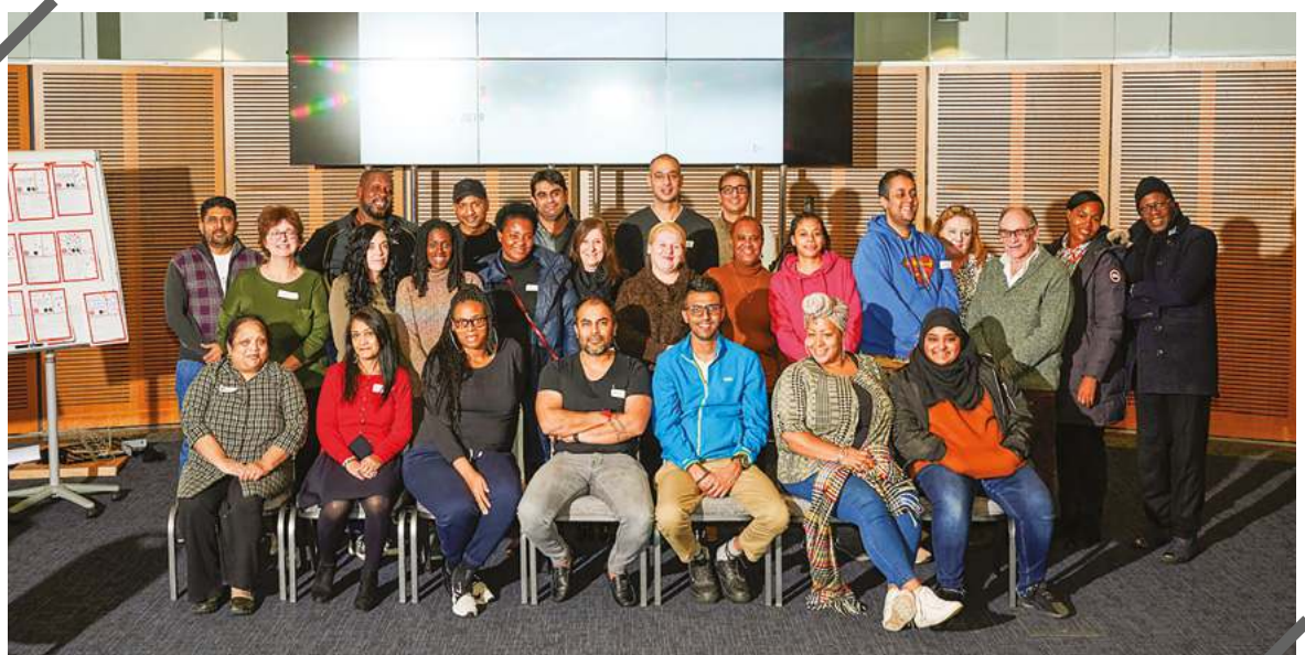
Brent Climate Assembly