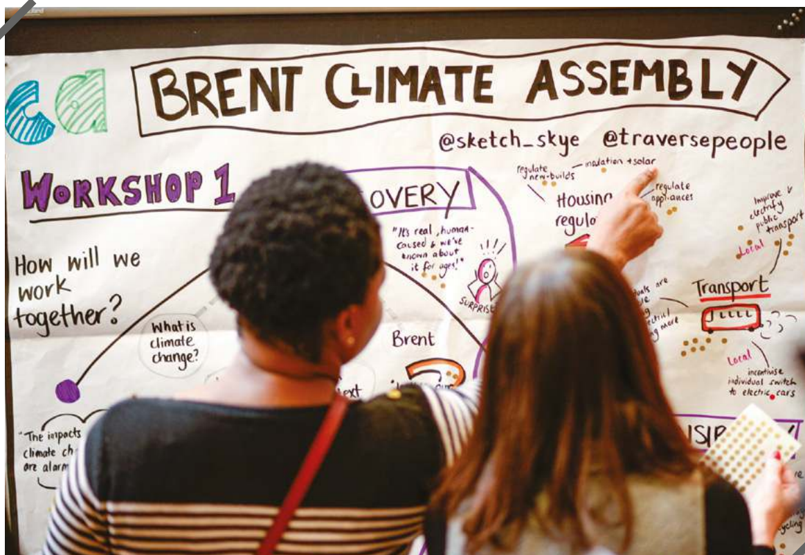
Brent Climate Assembly

a set of policy options, the responsibility of knowledge generation is delegated to experts. This inevitably means some previously neglected sources of knowledge and differing perspectives may be excluded, as well as denying citizens the opportunity to identify their own unique bespoke solutions. It may also mean that processes fail to recognise and challenge the systemic causes of the climate emergency. 36 This has opened climate mini-publics up to criticism for framing in such a way they exclude some topics, perspectives and voices.