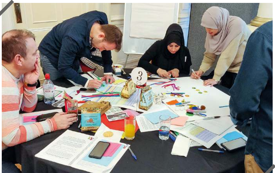
Newham Citizens' Assembly on Climate Change

It has been recognised globally and within the UK that the poorest and most traditionally marginalised communities are most adversely affected by the climate emergency. In recognition of this, should organisers seek to over-recruit such marginalised voices? Is equality or equity in inclusion the goal?