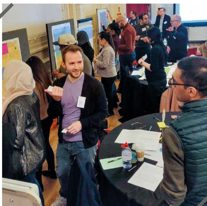
Newham Citizens' Assembly on Climate Change