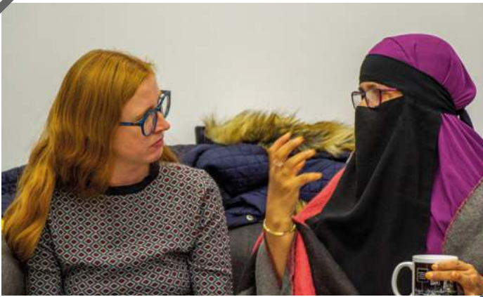
Leeds Climate Change Citizens' Jury

It is worth noting that those commissioning and delivering citizen assemblies and juries rarely analyse the impact beyond assessing whether the event was delivered to a satisfactory level. This seems partly due to budget constraints but also because it isn't always clear who has responsibility to analyse follow up of these deliberative processes. As a result, there is a very limited body of evidence to draw on. We conducted our own short research, but this is a snapshot in time, during a challenging year where local authorities are coping with an emergency pandemic. Ultimately the longer term impacts of citizen assemblies might not be realised some years after their implementation.