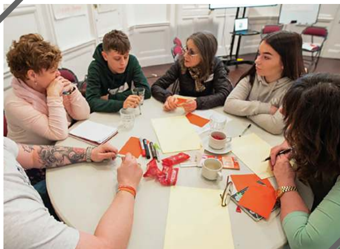
Lancaster and district Climate Change People's Jury

The process brings together a randomly selected sample of citizens that reflects the diversity of the local population. Led by independent facilitators, the citizens are given evidence by a range of speakers (experts, advocates and those with lived experience) and the support to deliberate in order to produce a set of recommendations. Juries and assemblies use the same methodology and only