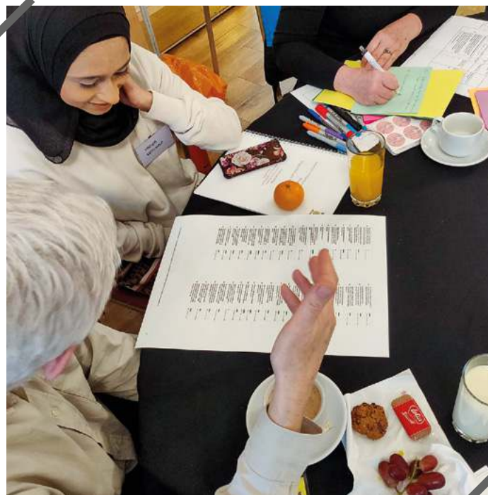
Newham Citizens' Assembly on Climate Change

As part of the Edmonton Citizens Panel on Energy and Climate Challenges, a 'Citizen Writing group' was formed made up of 8 volunteers who met for an additional 6 hours to 'support the development of recommendations and the creation of the final report'. Members had to complete an application form to be selected for the role.