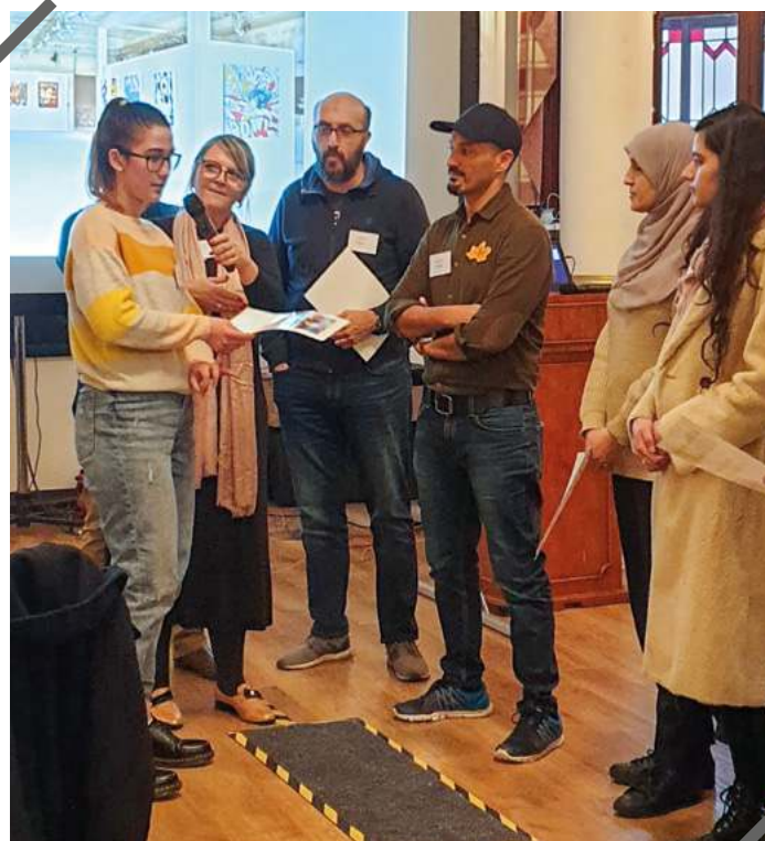
Role play as part of the Newham Citizens' Assembly on Climate Change

They then looked at a set of scenarios that helped to unpack the role of values before articulating their own, developing a shared understanding of these, working through the tensions that might exist between them and then prioritising them. Their final set of values were; sustainability, equity, quality of life and balancing individual freedom and the public good. 69