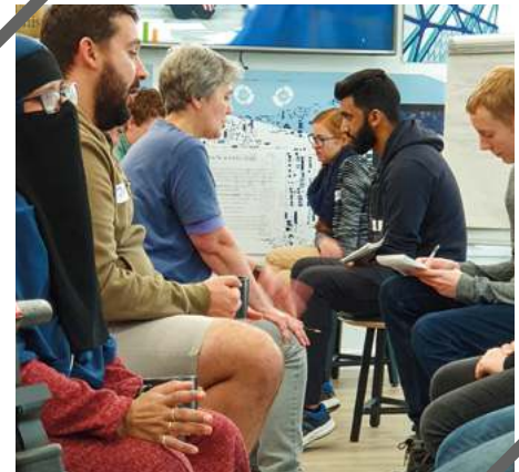
Leeds Climate Change Citizens' Jury

In 2020 Kendal town council commissioned the Kendal Climate Change Citizens' Jury. Aware that the Town Council has limited power and responsibility when it comes to climate change, it decided to work closely with all other tiers of government in organising the process, to enable the recommendations to apply beyond the town council's mandate. The oversight panel includes senior officer and politician representation from town council, district council and county council as well as the presence of the local MP able to take forward any recommendations that must be pursued at a national level. 40 At each meeting members of the oversight panel speak about how their organisation is able to respond to the recommendations produced at the end of the process.