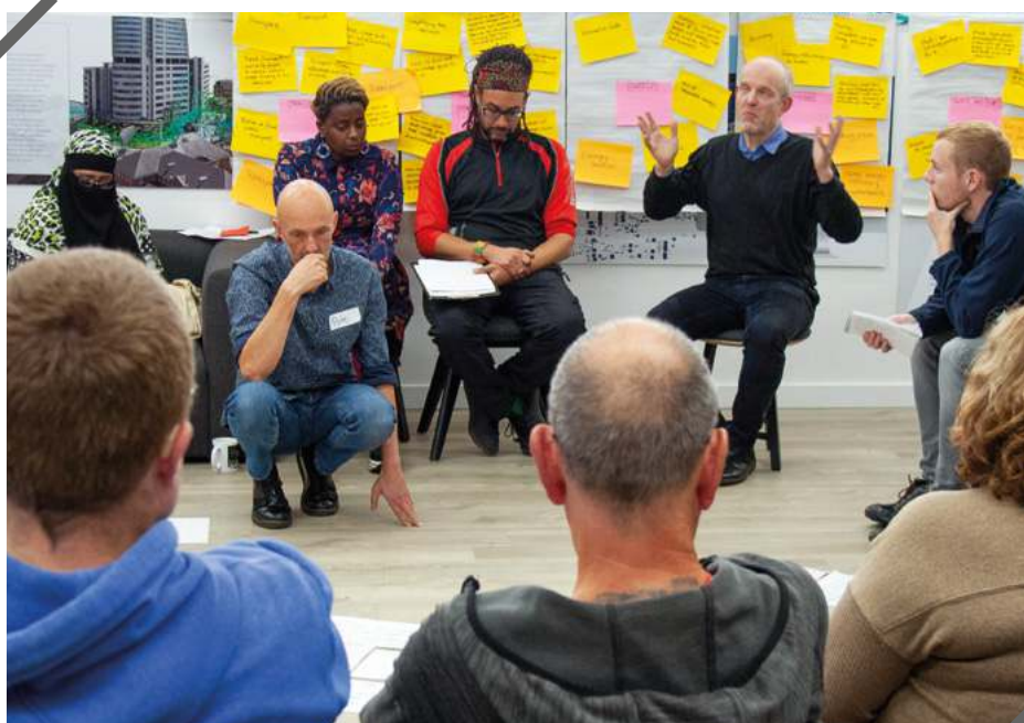
Leeds Climate Change Citizens' Jury

In Newham a call-out on the assembly webpage invited any local groups or individuals that wished to present evidence for the assembly to contact the organisers. In many processes citizens themselves are given the opportunity to suggest potential speakers.