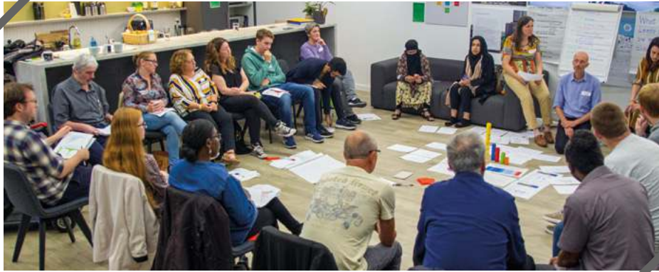
Leeds Climate Change Citizens' Jury

T o date, climate policy in the UK has largely been developed and implemented with either no or very little public engagement. Most of the emission reductions that have happened so far have been a result of changes in the energy market as the price of renewable energy has plummeted, and when government incentives were in place. This has had relatively little financial impact on the public, beyond those who purchased rooftop solar panels and benefitted from the income they bring through now discontinued feed in tariff schemes.