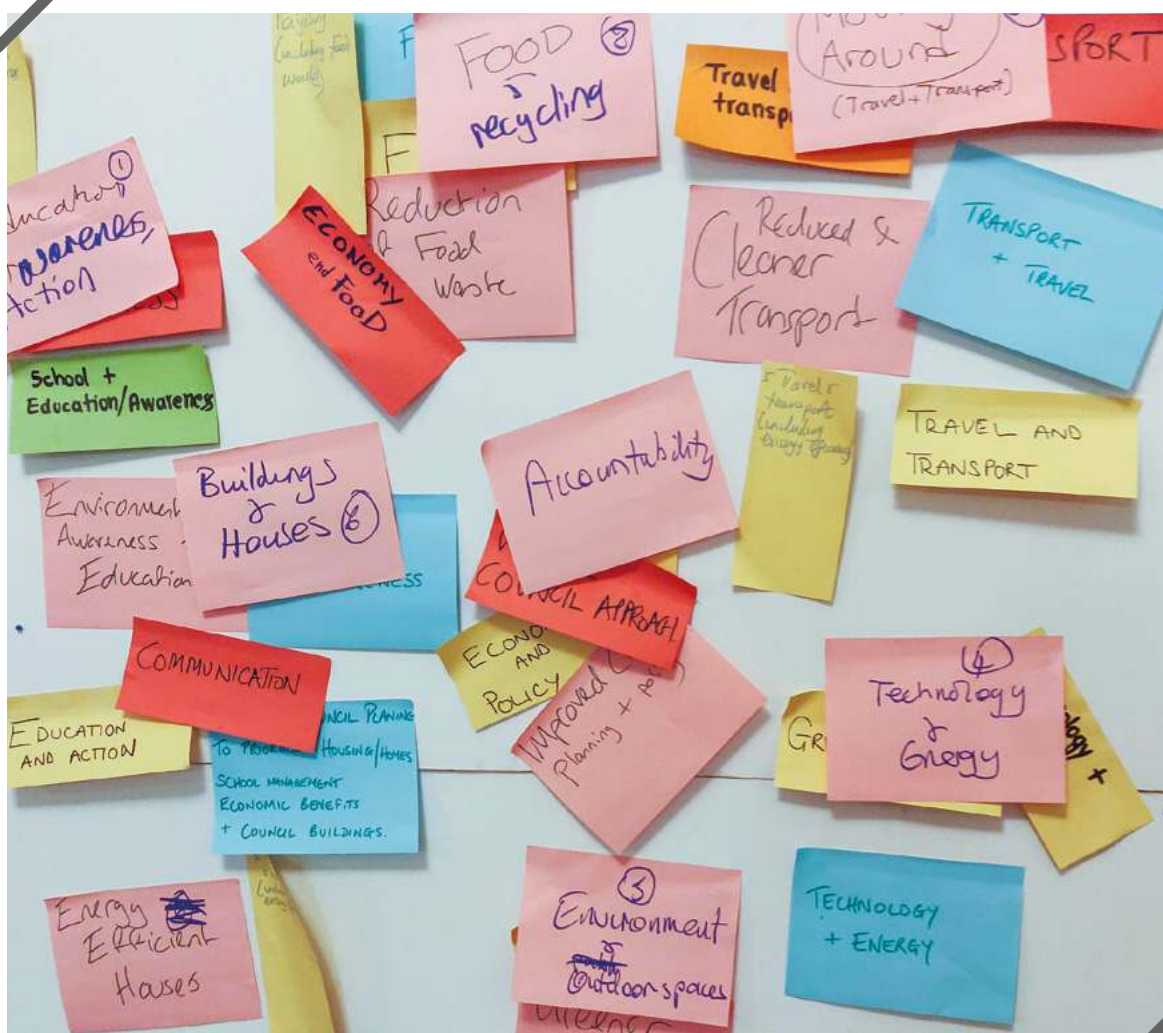
Newham Citizens' Assembly on Climate Change

the importance of a robust recruitment process for assembly and jury members. Emerging evidence shows that if a citizens' assembly or jury is well publicised, the wider public may tend to trust them more than many other institutions. For example citizens in the US state of Oregon when surveyed on 'quality of judgments' viewed the Citizens' Assemblies associated with the Oregon Citizens' Initiative Review as the most credible body (alongside criminal juries), comparing favourably to the state legislature and Congress. This suggests a citizens' assembly or jury could enable wide local support across the constituency, reaching beyond simply the views of the participants in the process.