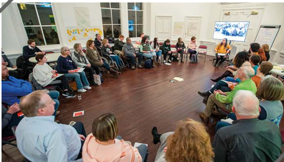
Lancaster and district Climate Change People's Jury