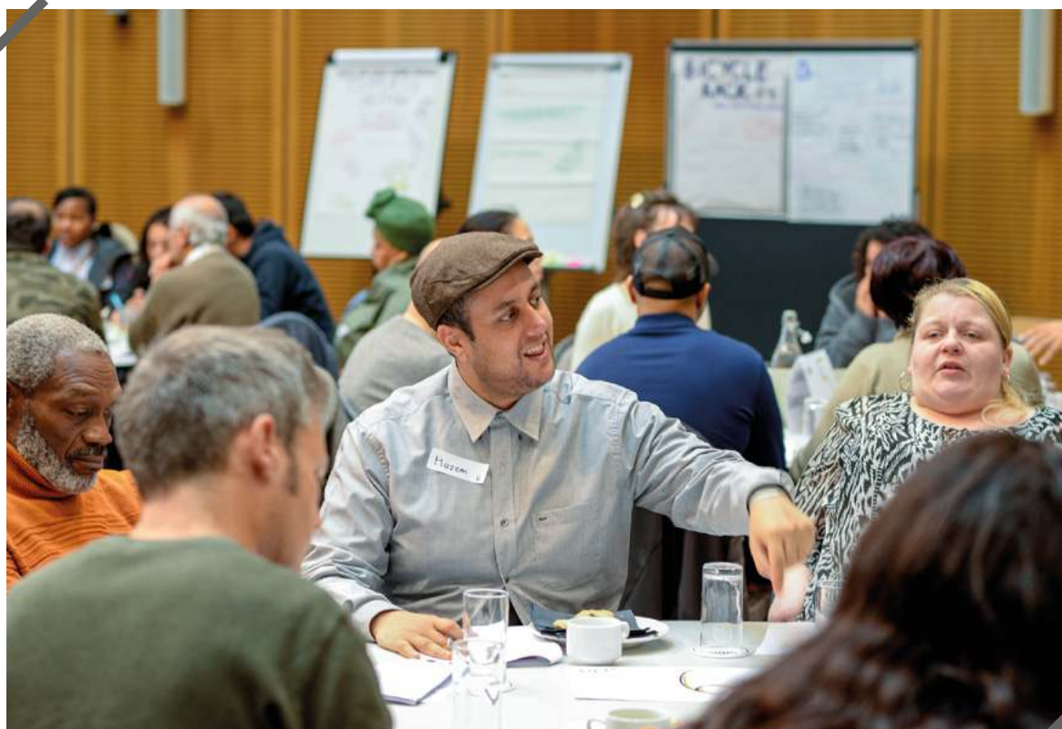
Brent Climate Assembly Image © Traverse

Another related impact is that the experience of a citizens' assembly often led to an interest in adopting deliberative processes more broadly across other policy areas. Councillors, officers, and other stakeholders, many of whom were sceptical about the value of a citizen assembly prior to the experience, have since become advocates of deliberation for council policy making. Some of the initial scepticism often comes from the interpretation of deliberative