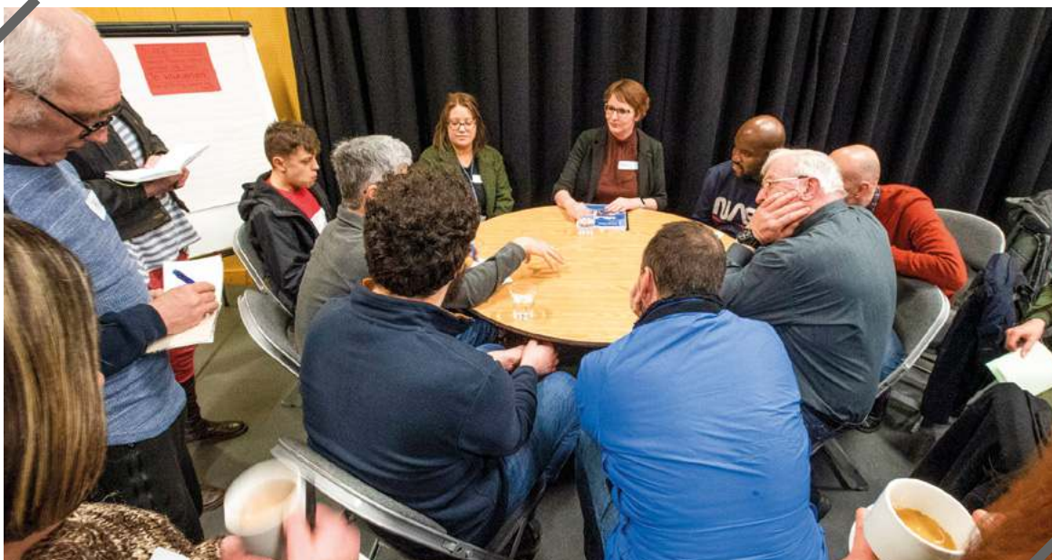
Lancaster and district Climate Change People's Jury

processes like citizen assemblies as trying to replace democratically elected decision making. However, most practitioners and advocates position deliberation as complimentary and enhancing democratic processes.