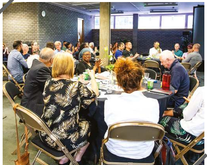
Camden Climate Assembly

Impartial: It is harder to ignore the recommendations of a diverse body of citizens that reflect the wider population rather than the views of environmental activists or fossil fuel stakeholders who may be accused of being biased or partisan. The Chief Executive of Brent Council described how valuable it was hearing from such a broad range of their citizens, describing how the room of participants 'looked like Brent'. This underlines