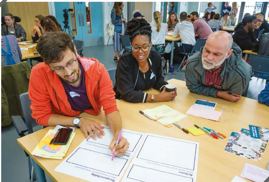
Camden Climate Assembly

TIP: Don't underestimate the importance of the "soft" people-skills that help participants feel comfortable and welcome. Humour is essential.