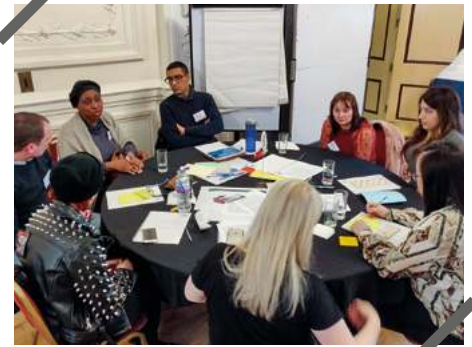
Newham Citizens' Assembly on Climate Change